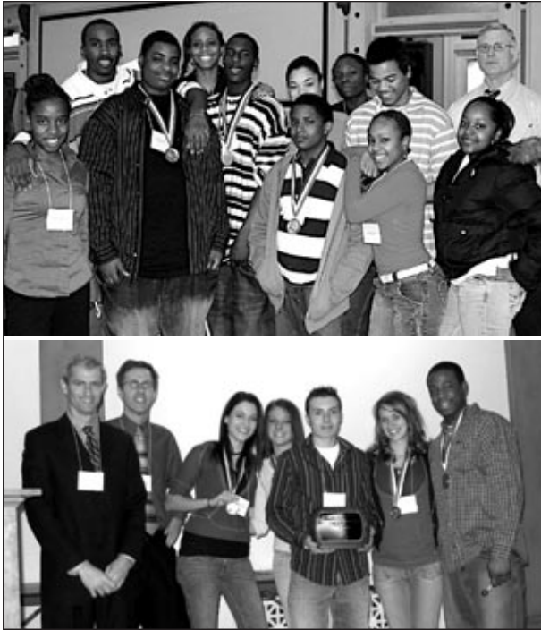
FIGURE 1 Two winning high school engineering design teams.

reason, how well they integrate complex information, and how much relevant science and mathematics knowledge they have mastered.